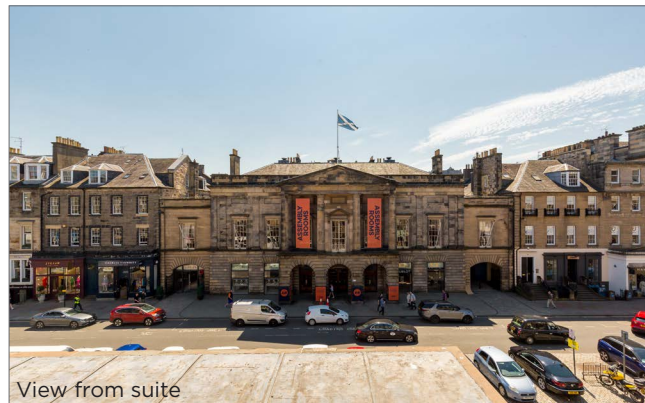
View from suite