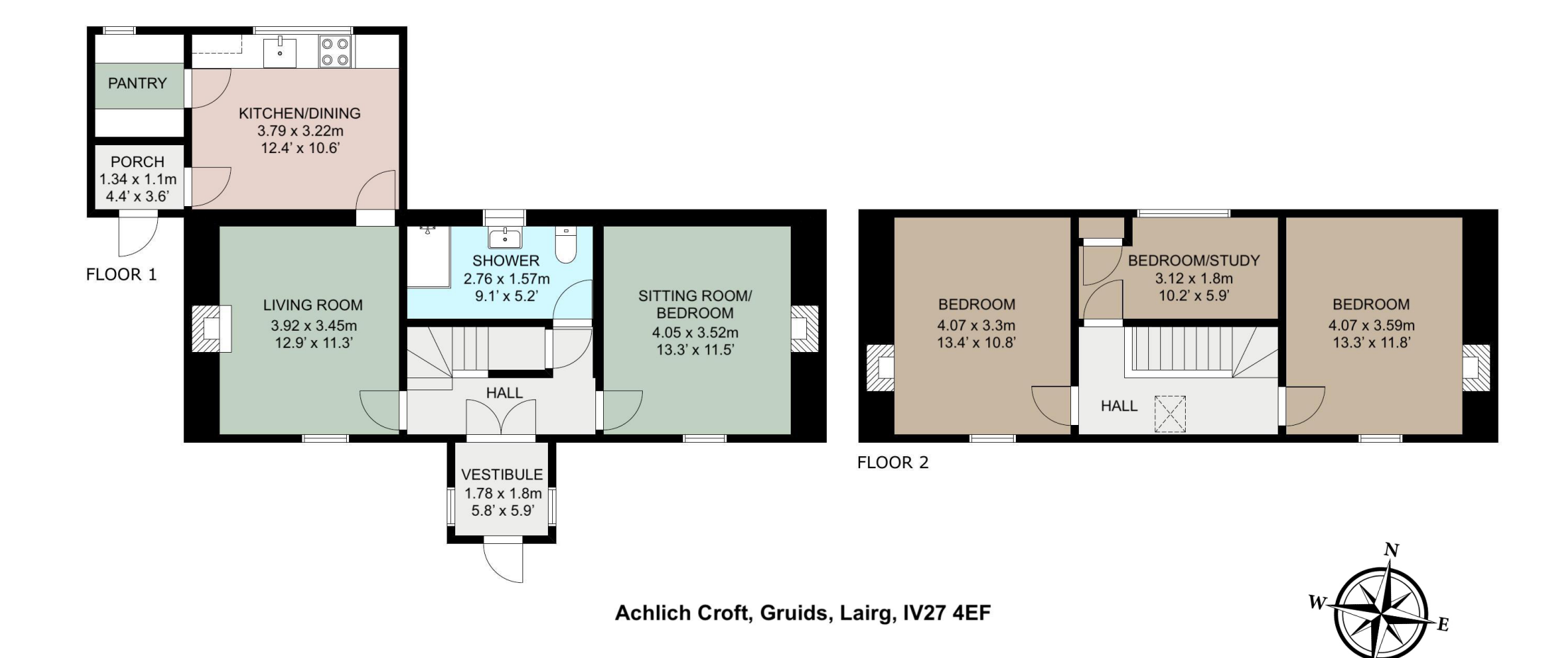
Illustration for identification purposes, actual dimension may differ. Not to scale.